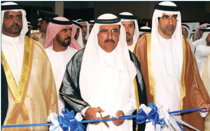
H.H. Sheikh Hamdan Bin Rashid Al Maktoum, Deputy Ruler of Dubai, Minister of Finance and President of Dubai Health Authority inaugurates the 15 th UAE International Dental Conference & Arab Dental Exhibition – AEEDC Dubai 2011, on 1 February 2011 at the Dubai International Convention and Exhibition Centre.

The Premier Dental Gathering in the Middle East and North Africa