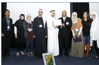
Kuwait University The winner of the "AEEDC Knowledge Champion 2011"

There were 4 Universities in the competition this year namely Future University from Egypt, Kuwait University from Kuwait, Sana'a University from Yemen and Sharjah University from UAE.